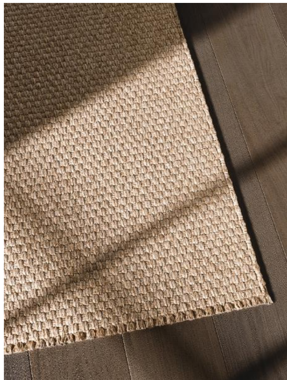
MENORCA TALCO - NATURAL BORDER