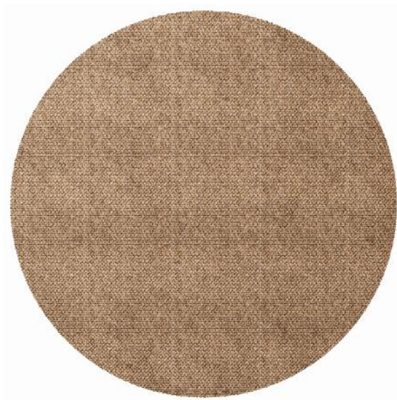
MENORCA SABBIA round ø 2m