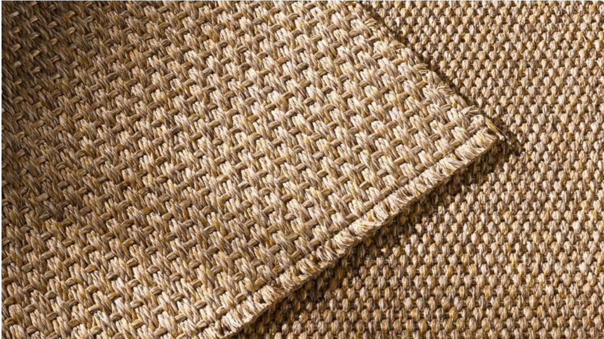
NATURAL BORDER – CAPRI and RODI, Color SABBIA