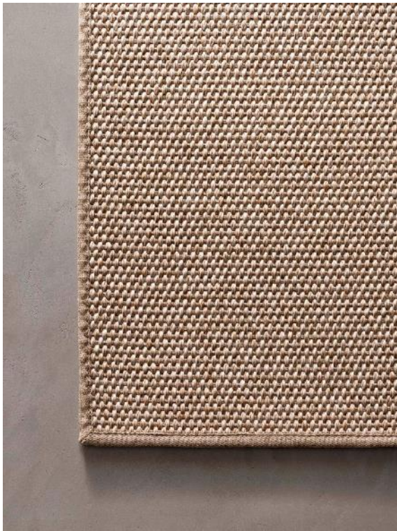
RODI TALCO – TEXTILE BORDER