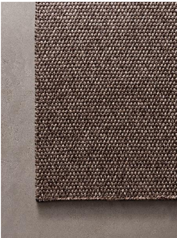
RODI VULCANO - NATURAL BORDER