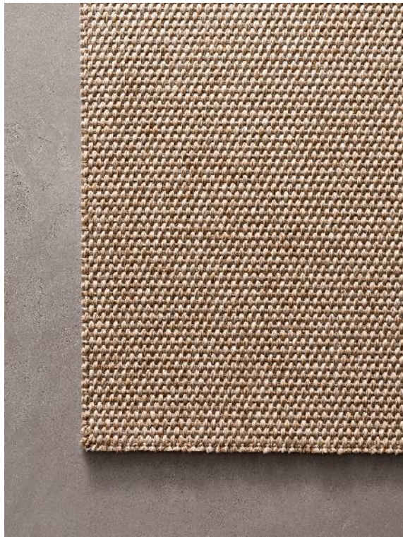
RODI TALCO – NATURAL BORDER