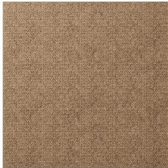
CAPRI SABBIA 2x2m